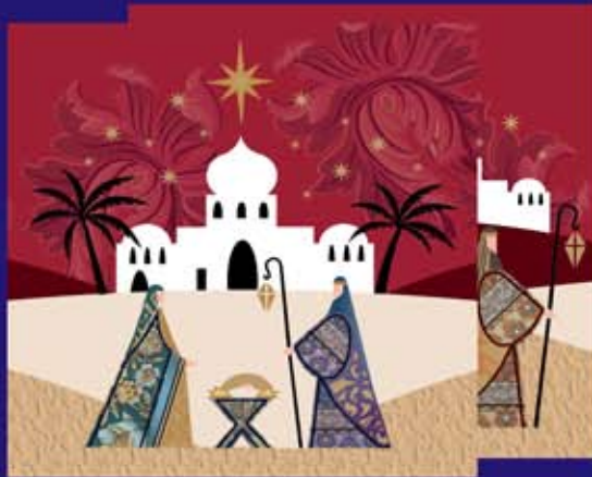
B. Shepherds & Nativity Gold Foil 127x127 Images on both front and back of card 'Rejoice in the blessing of Christmas'