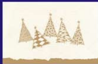
E. Golden Trees Gold Foil 117x178 'Warmest greetings of the Season and every good wish for the coming year'