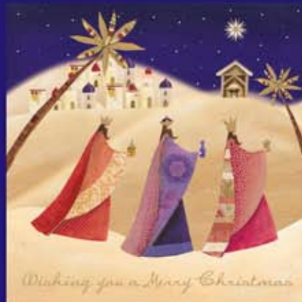
H. Three Wise Men Gold Foil 127x127 'May peace, joy and love be your gifts this Christmas'