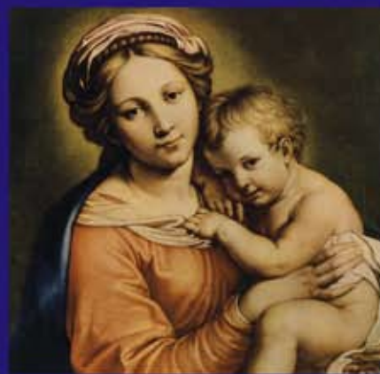
C. Madonna and Child Giovanni Battista Salvi da Sassoferrato 127x127 'Wishing you peace, love and joy this Christmas'