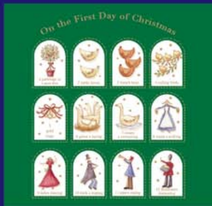
A. 12 Days of Christmas 127x127 'Best wishes for the Christmas season and the coming year'