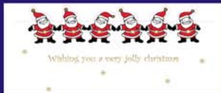
D. Jolly Santas Die-Cut 80x182 'Season's Greetings'