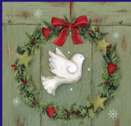
G. Wreath & Dove 127x127 'Season's Greetings and all good wishes for the New Year'