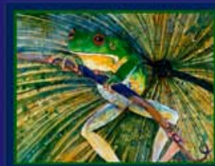
F. It's Easy Being Green Greeting Card 115x175