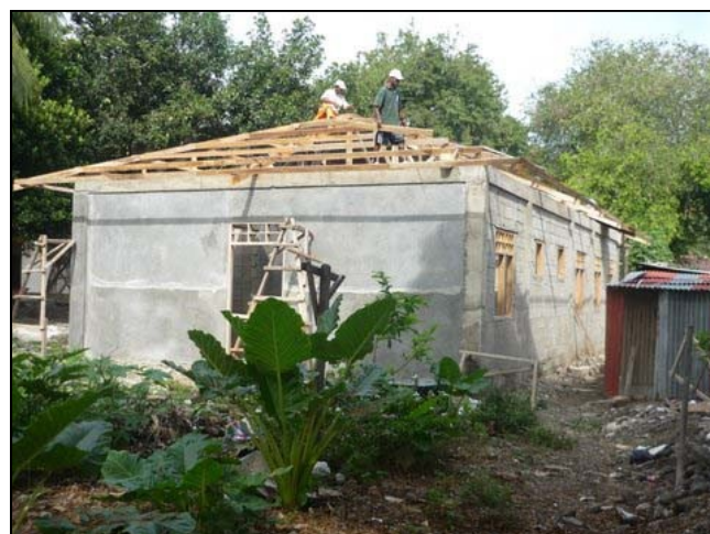
Residents' cottage under construction at Klibur Domin

TO KEEP IN TOUCH WITH NSW NEWS, REMEMBER TO LOG ON TO OUR WEBSITE. The website can be found at: http://www.rydercheshirensw.wordpress.com